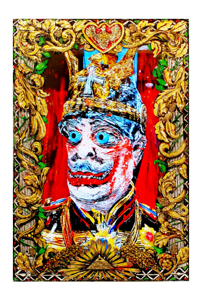
Federico Solmi, TheGreat Unifier, 2015, Handpainted animated Video, 41 x 61 cm