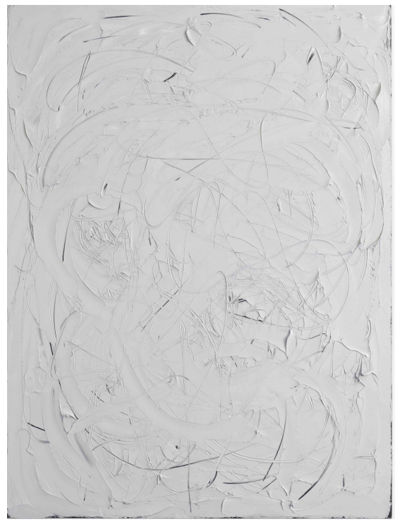
Liat Yossifor, Cuts (Grey), 2017, Oil on Linen, 152,4 x 203,2 cm